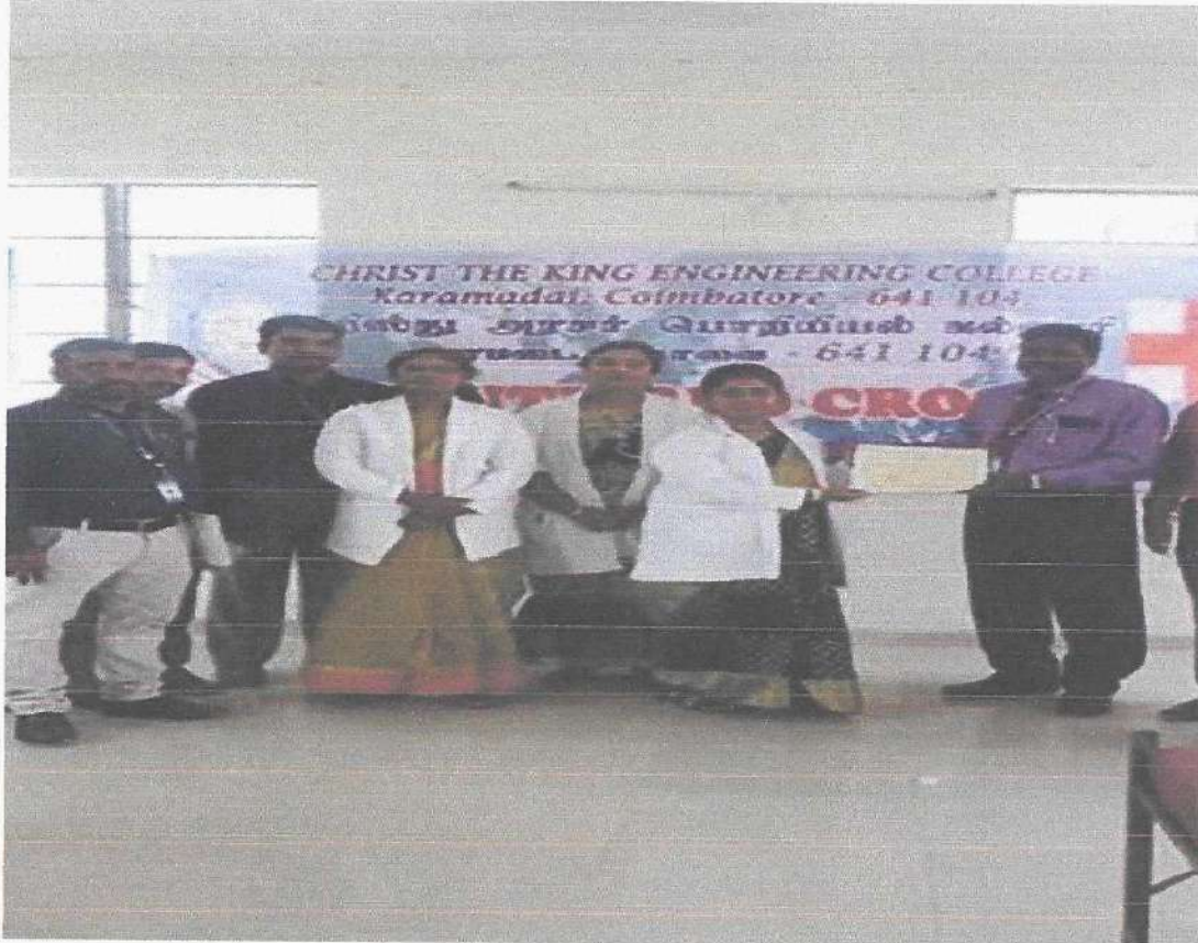
Blood Donation Camp at CKEC campus Chikkarampalayam on 30.08.2019